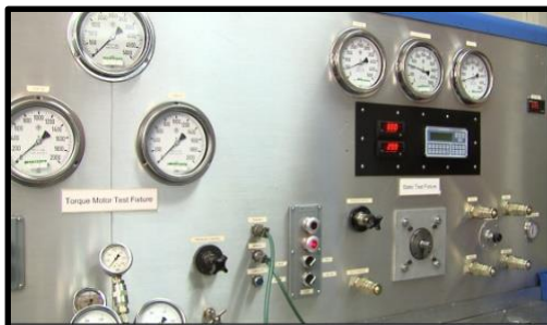
Torque Motor & Static Servo Testing