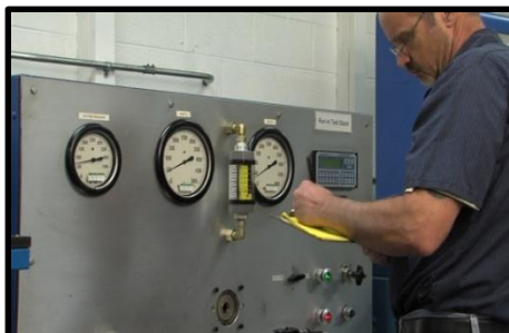
Dedicated Run – In Stand

Our Servo Valve Repair Lab has the capability to provide computer controlled dynamic and static testing. Our state of the art computerized load stands ensure that each valve meets OEM specifications.