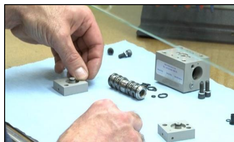
Clean Air Assembly Benches